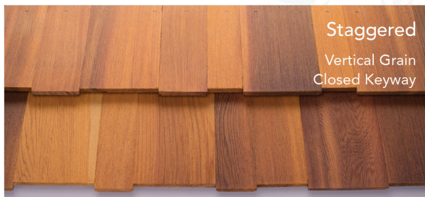
Staggered Vertical Grain Closed Keyway