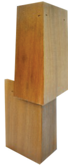
Pre-made Mitered Corners