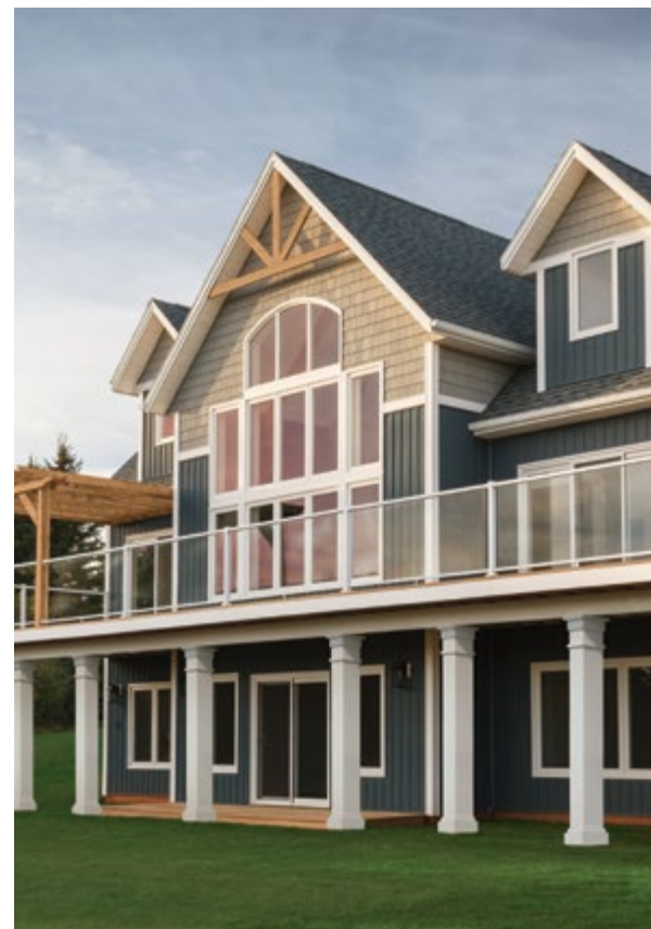
Royal® Board & Batten in Heritage Blue, Portsmouth™ D7 Cedar Shingles in Flagstone, Zuri® Premium Decking in Chestnut, Royal® Vinyl Trim in Antique White, Royal® Column Wraps in White