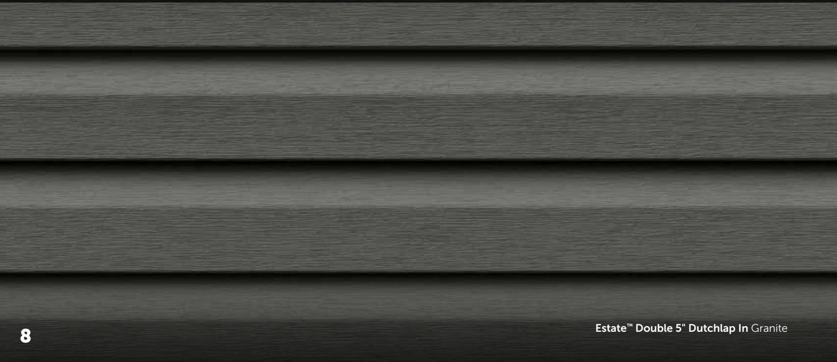
Estate™ Double 5" Dutchlap In Granite