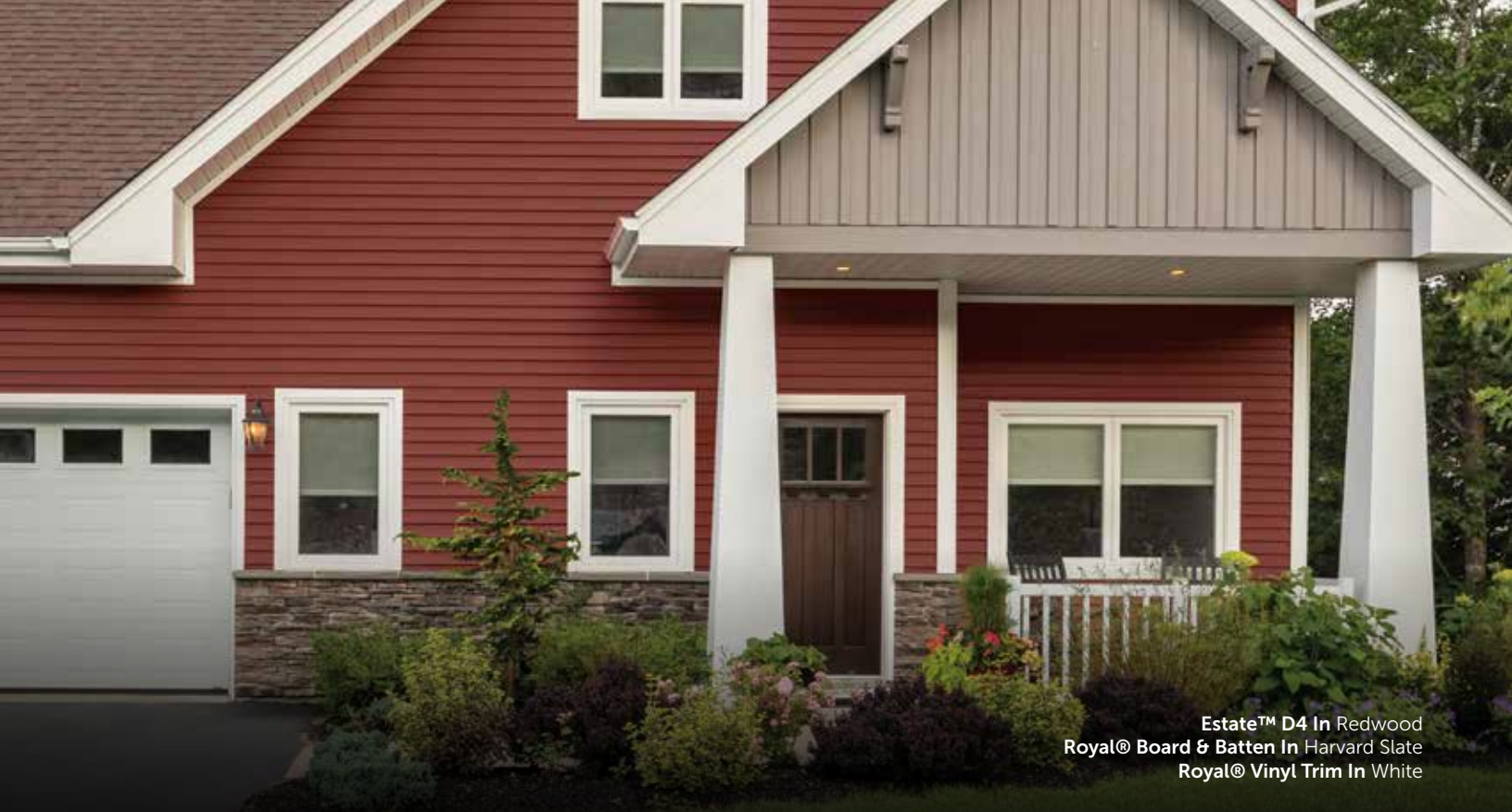
Estate™ D4 In Redwood Royal® Board & Batten In Harvard Slate Royal® Vinyl Trim In White