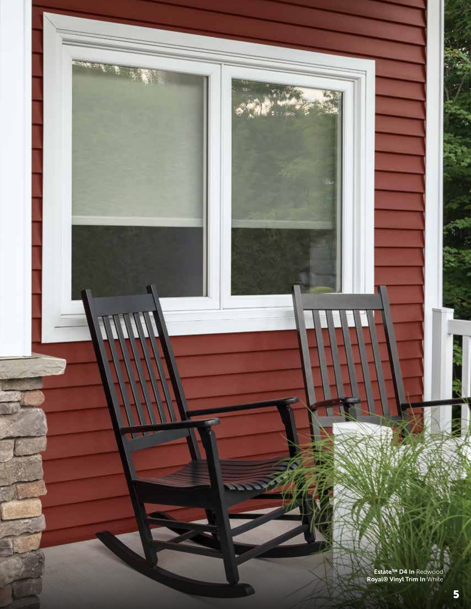
Estate™ D4 In Redwood Royal® Vinyl Trim In White