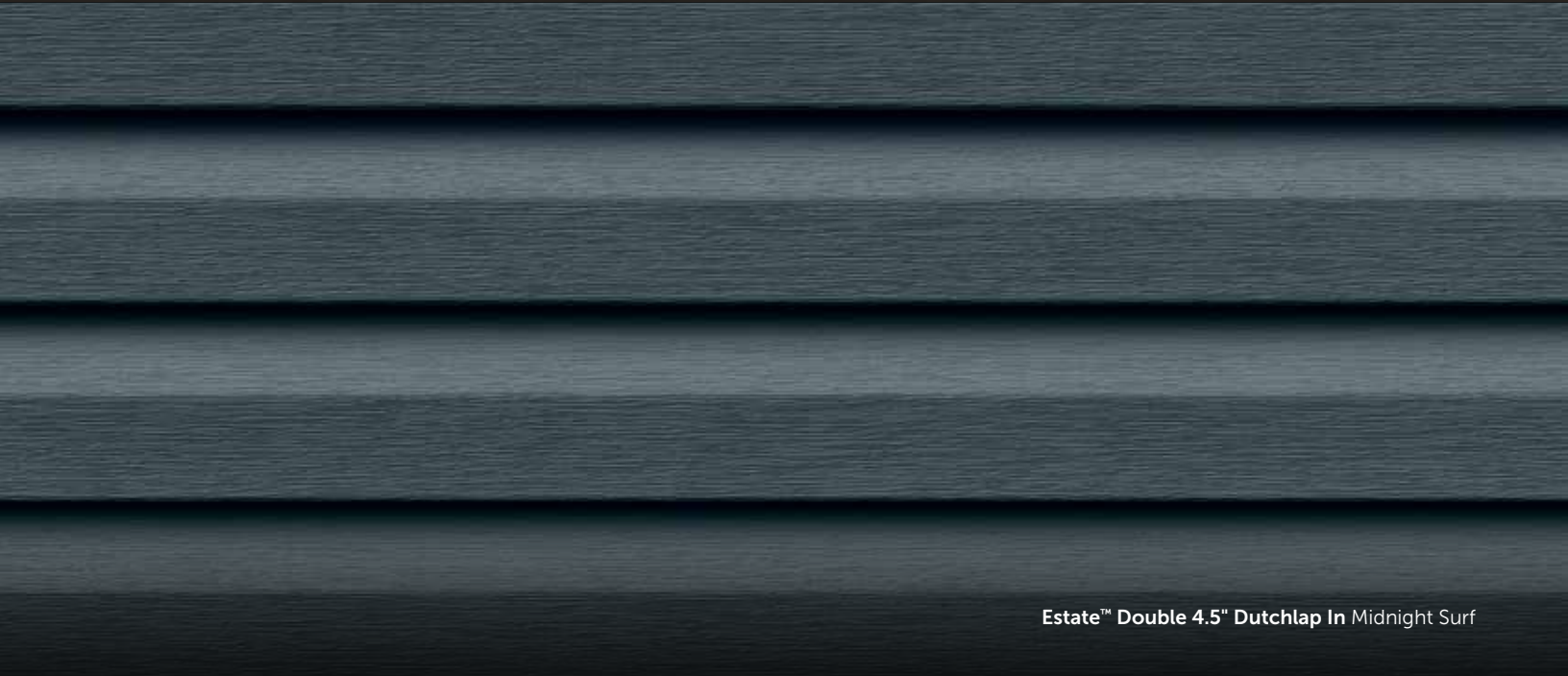
Estate™ Double 4.5" Dutchlap In Midnight Surf