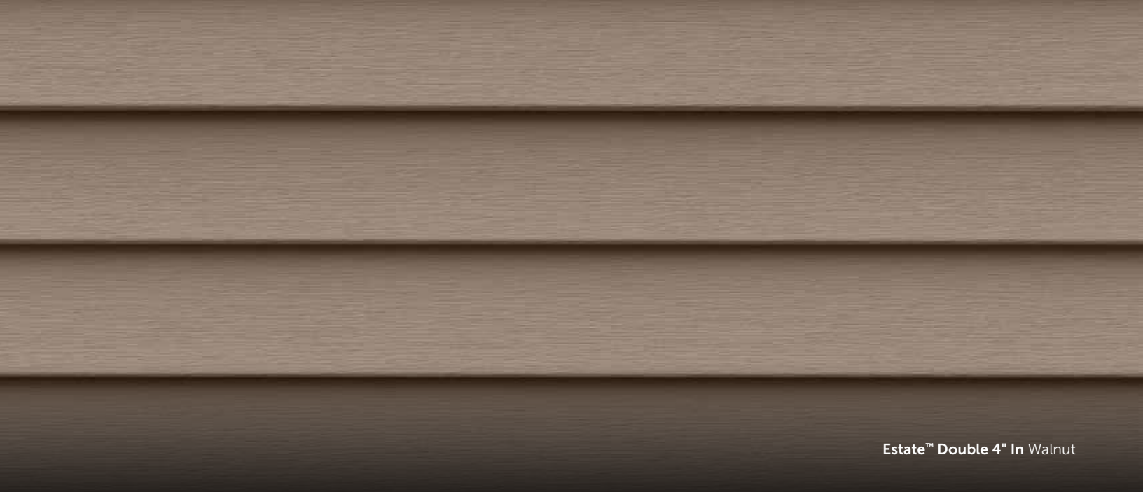
Estate™ Double 4" In Walnut